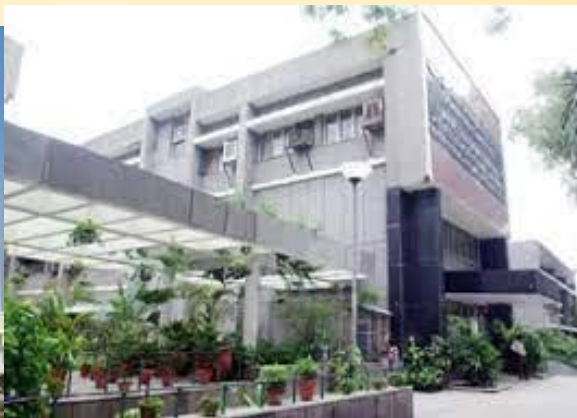
PDUNIPPD, New Delhi

(Institutes under the Department of Empowerment of PwDs (Divyangjan), Ministry of Social Justice & Empowerment, Government of India)