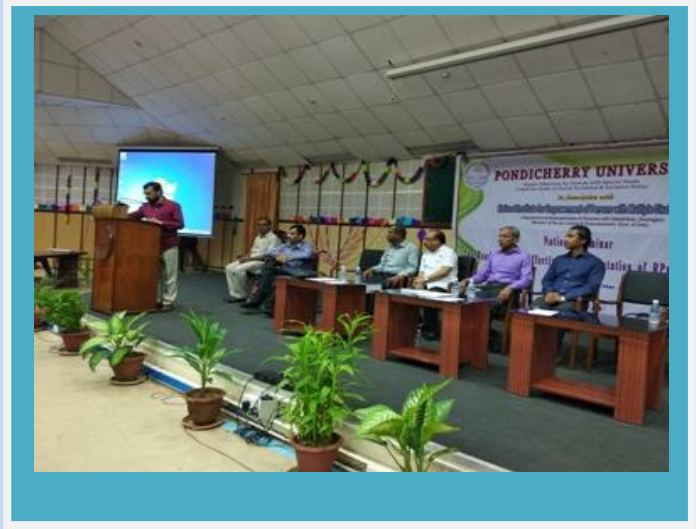
One-day National Seminar on "The Road Map for Effective Implementation of RPwD Act, 2016" at Pondicherry University on 17.5.18