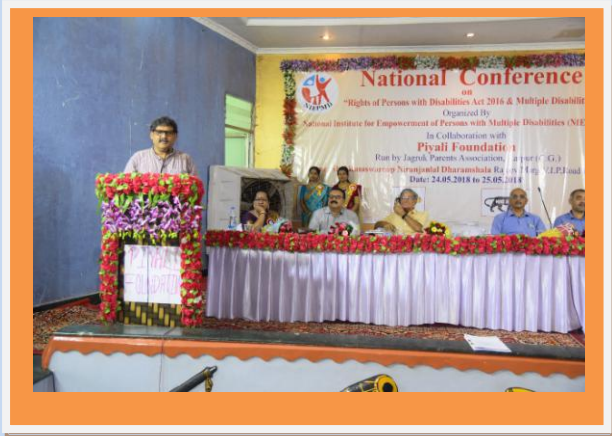
National Conference on Rights of Persons with Disabilities Act 2016 & Multiple Disabilities was organized at Raipur, Chattisgarh on 24 th and 25 th May 2018