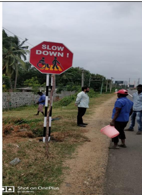
Fixing of signage boards adhering to the safety of PwDs crossing roads outside NIEPMD. The following activity was carried out with the support Shri. S.K. Samy, AEMO, NIEPMD