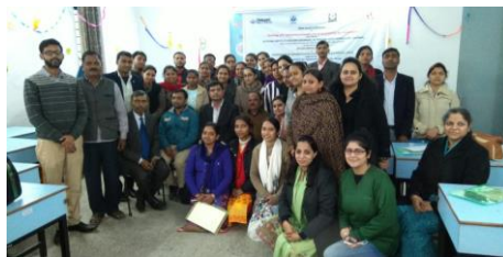
Participants of the State Level Conference held at New Delhi on 22 nd & 23 rd Dec 2018