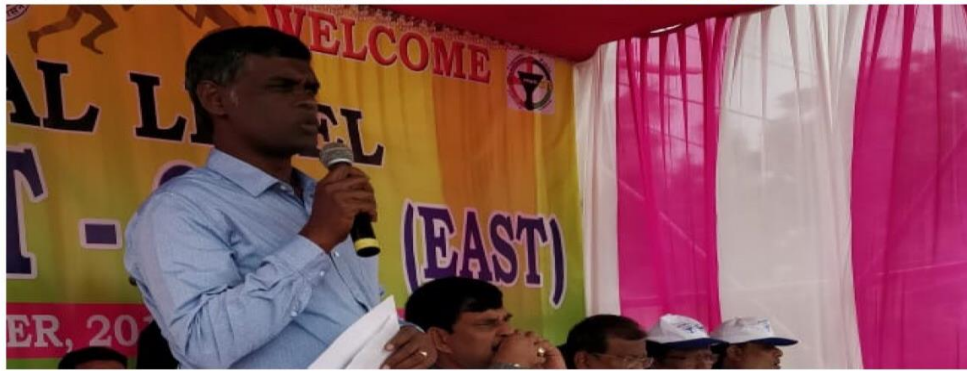
East Zone Sports Meet for Diploma Teacher Trainees organized at Bhuwaneswar, Odhisha On 15 th & 16 th Dec 2018