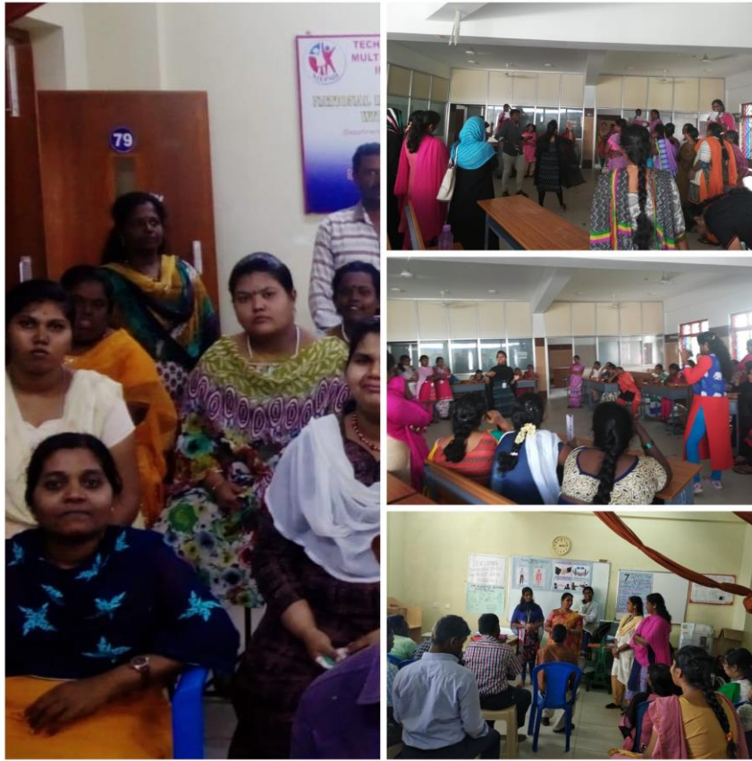
MSW Interns conducted programmes on interpersonal skills for Parents and Adults with MD on 27 th December 2018