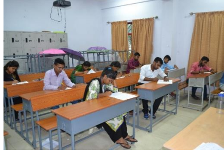
Awareness program for Govt.School students