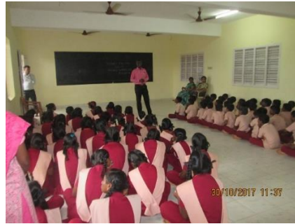
Certificate and Prize distribution for the winners of Poster, Essay and Elocution Competition