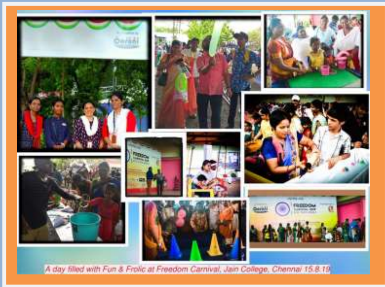
Visit to Freedom Carnival, Jain College, Chennai on 15.8.19, along with clients attending services.