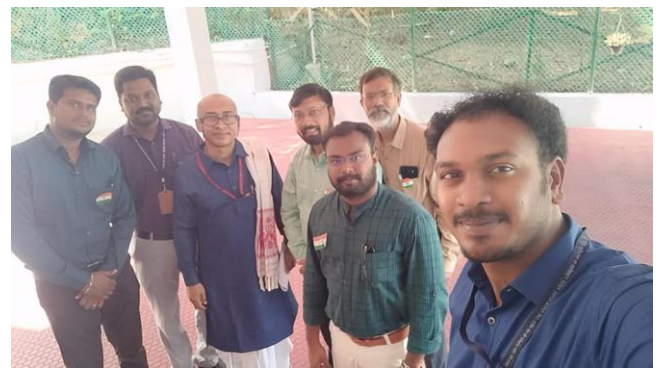
Official duty at Andaman from 24 th to 28 th January 2020