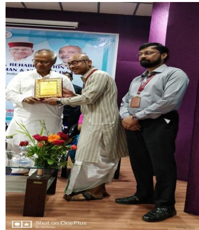
Composite Regional Centre for Skill Development, Rehabilitation and Empowerment of Persons with Disabilities (Divyangjan) on 27 th January 2020