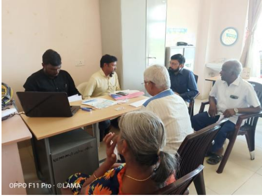
Organised a camp on Legal guardianship at NIEPMD in collaboration with Swastik Trust on 9 th January 2020