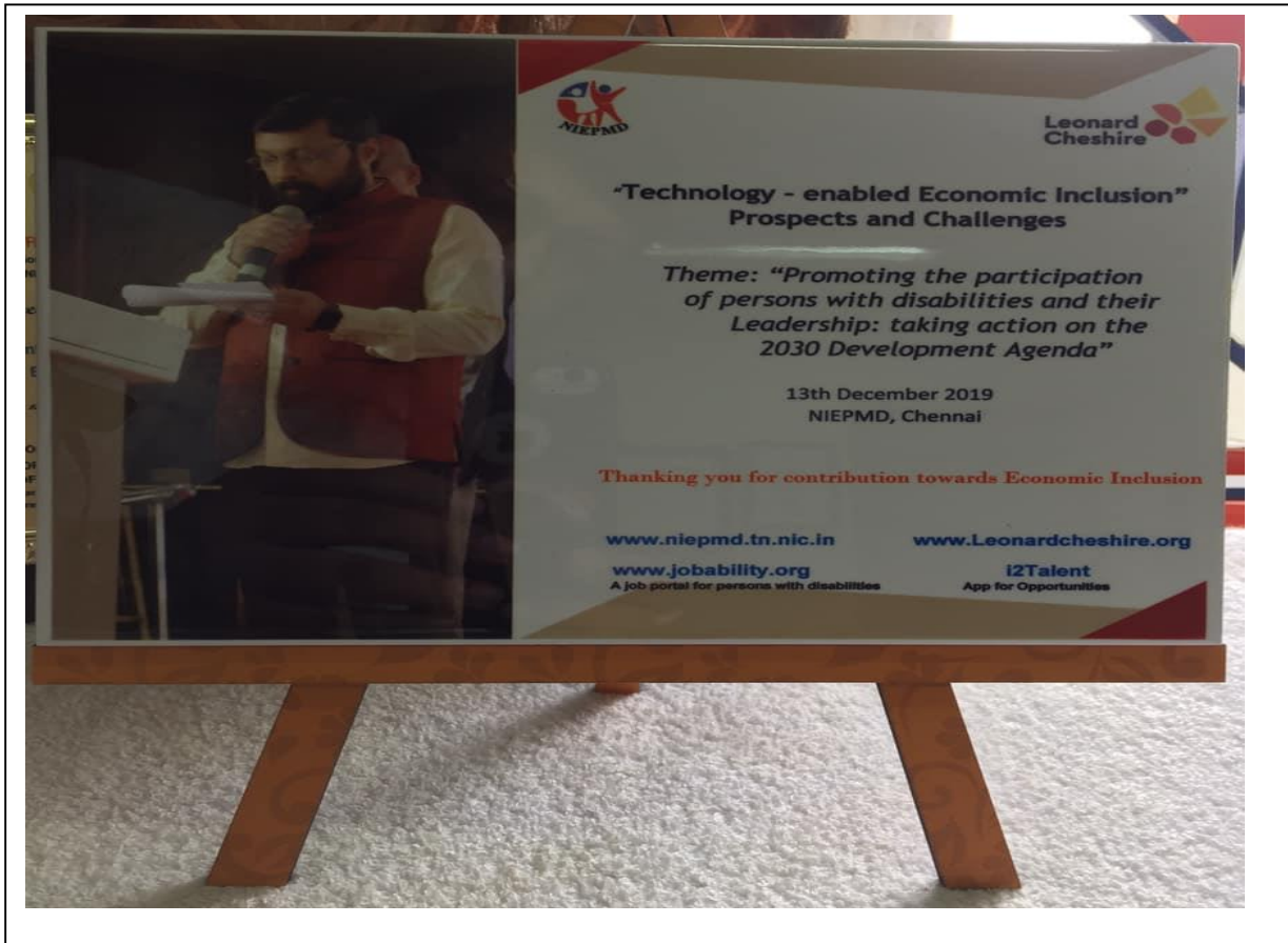
Anchored the programme, "Technology- enabled Economic Inclusion" prospects and challenges held at NIEPMD on 13 th December 2019.