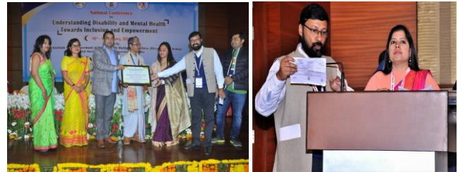
Presented Best practices in social work in fostering mental health paradigm shift at NIEPMD at the National Conference on Understanding Disability and Mental health towards inclusion and empowerment at Maharashtra Sadan, New Delhi dated 16 th and 17 th January 2020