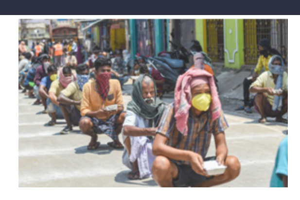
Quality of relationship.