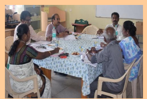
3rd Advisory Board Members meeting

Socio – Vocational – Economic empowerment is a noble assignment that could be achieved only with the combined efforts hence the DAIL honestly solicides your heartily support to