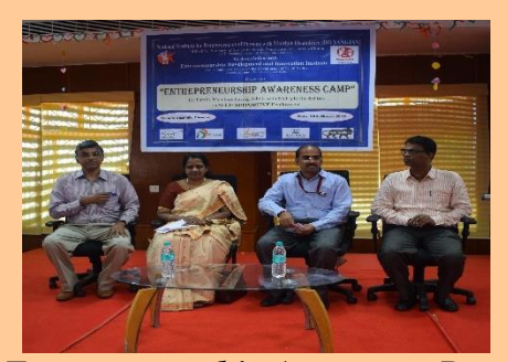
Entrepreneurship Awareness Programme