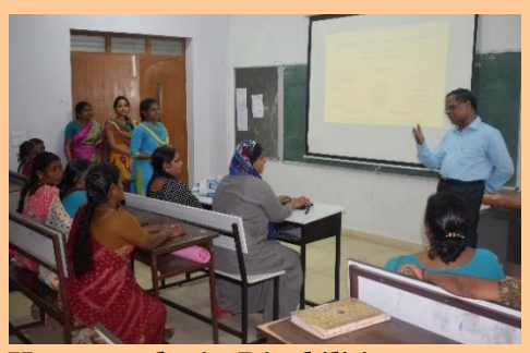
Homeopathy in Disabilities