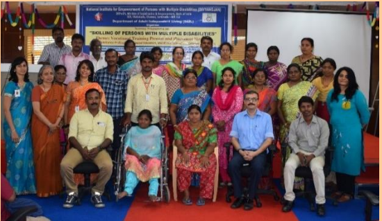
Training Programme on Skilling of Persons with Multiple Disabilities