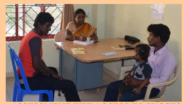
ASSESSMENT-THE ACCESS TO SUCCES

ASSESSMENT: It's a multifaceted and dynamic data collection process of gathering and analysing information of the Clients, aged 14 years onwards in order to plan; make appropriate strategies on Educational. Psycho – social economic rehabilitation facilitating proper effective implementation.