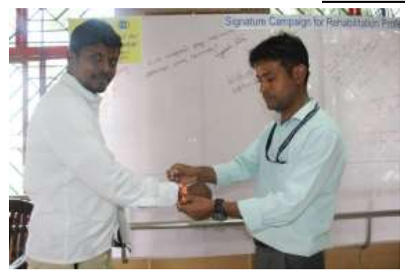
28th October 2019

On 31<sup>st</sup> November 2019, NIEPMD organized Poster & Elocution Competition for HRD Trainees, Slogan Competition for Parents of PwDs and Awareness program to Housekeeping & Securities staff as part of the Vigilance Awareness Week.