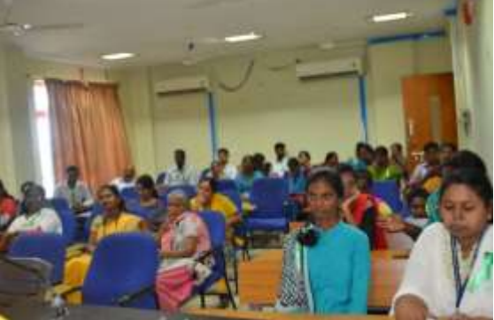
Parent Training Program