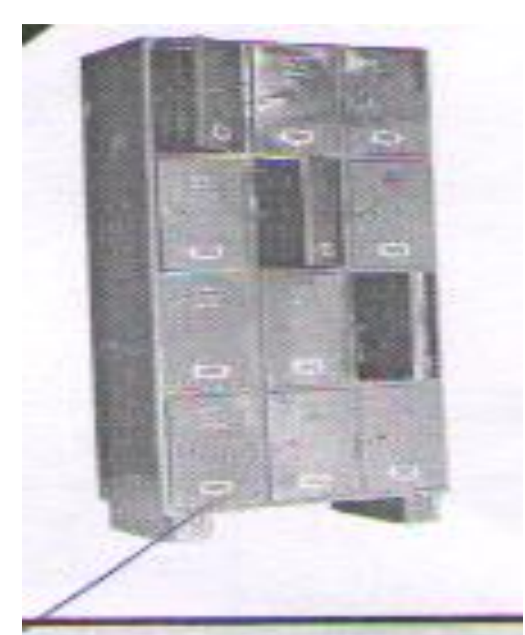
SIZE: 78" x 36" x 18"